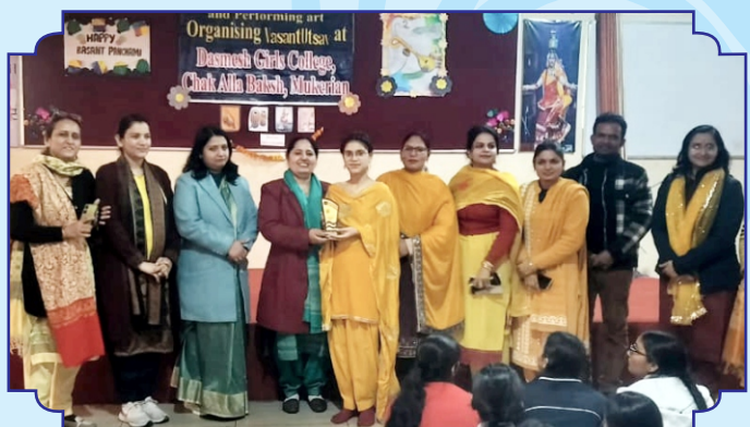
Celebration Of Basant Panchmi