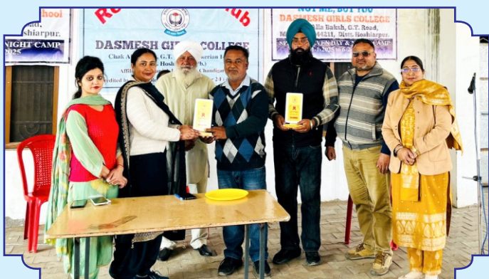
World Cancer Day & AIDS Prevention