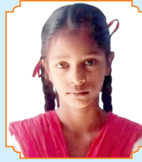
Palak BSC (NM) 2nd Sem-90.2%