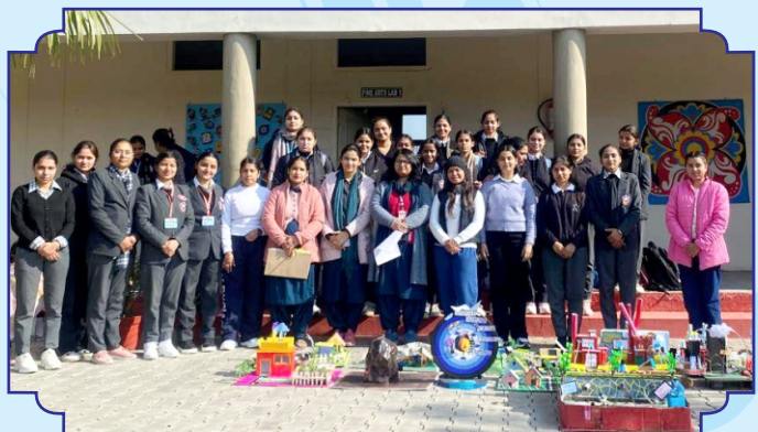
National Youth Day