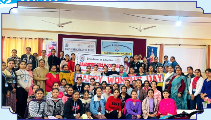
International Women's Day Celebration