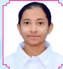
Namika BCA 4th Sem-82.9%