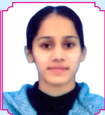
Upasana BSC 6th Sem-87.1%