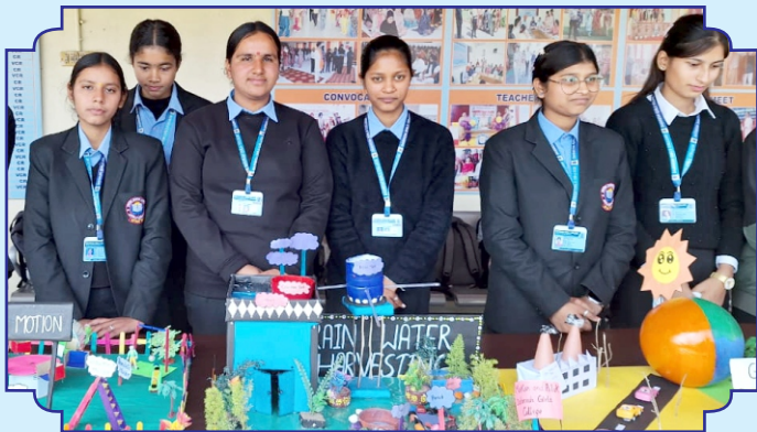
National Science Day