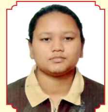
Palak BA 2 nd +70 KG SILVER MEDAL