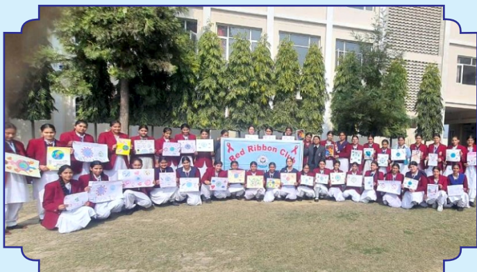
HIV-AIDS Awareness Campaign