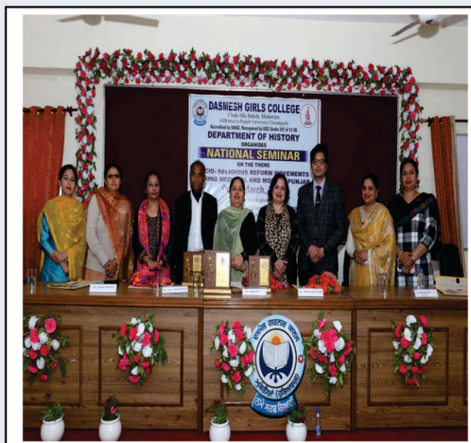
ICSSR Sponsored Seminar In History Being Organized