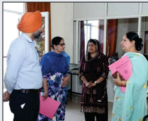
Academic and Administrative Audit Being Held