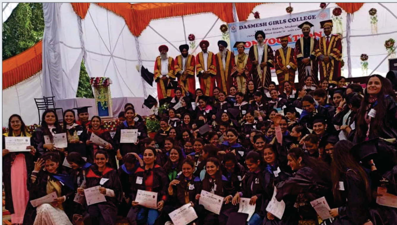
Graduates Being Conferred With Degrees