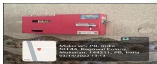
Installation of Sanitary Napkin Vending Machine in Mata Gujri Block & Mata Sundri Block