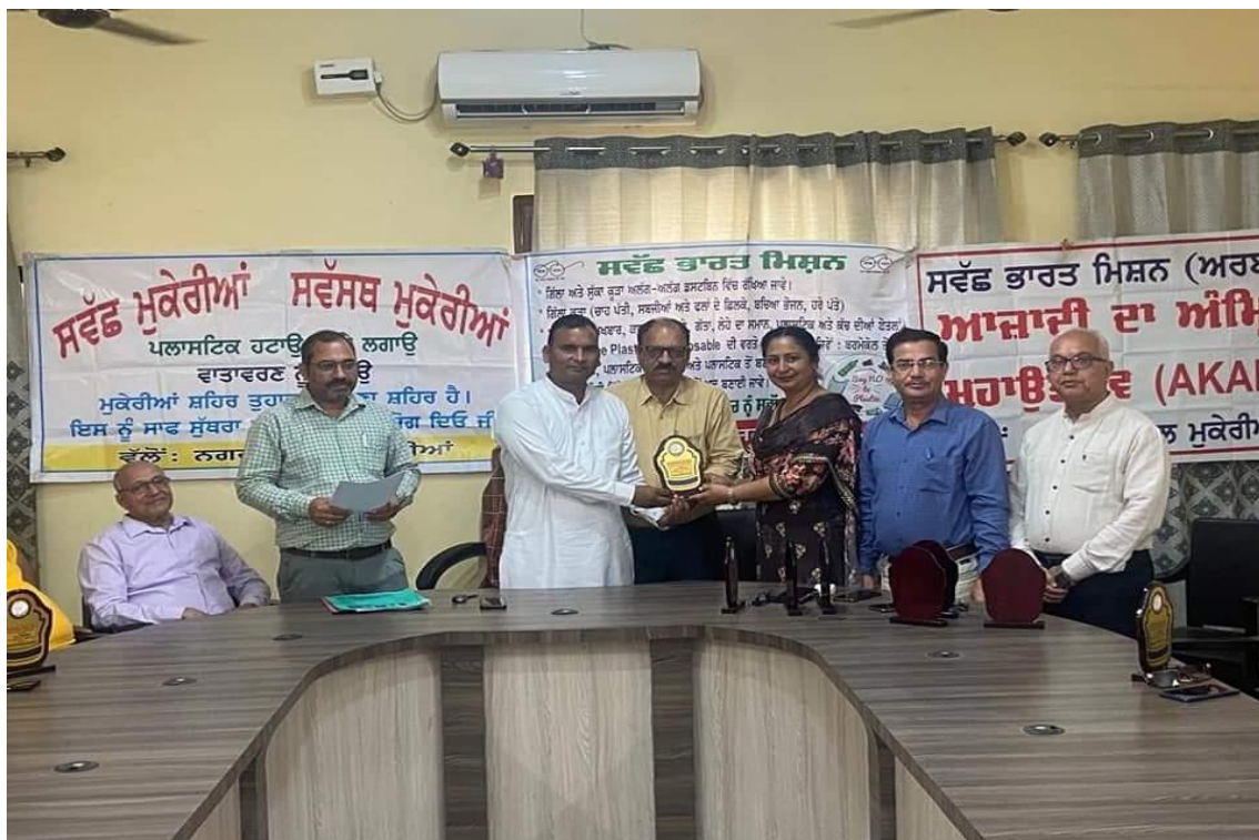
College being awarded First Prize in "Swachta Bharat Mission" by Municipal Council, Mukerian.

Mahatma Gandhi National Council of Rural Education Department of Higher Education Ministry of Education Government of India