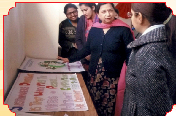
Slogan Writing Competition