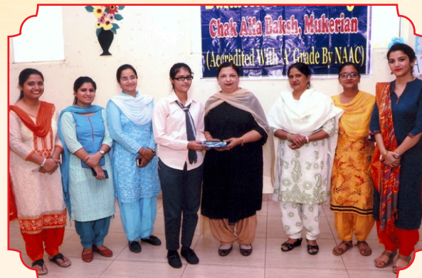
Gandhi Jayanti Celebration