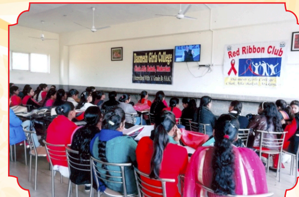
Red Ribbon Club