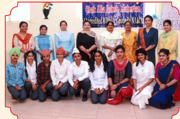
Gandhi Jayanti Celebration