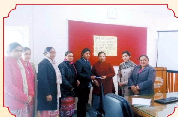
International Mother's Language Day Celebration