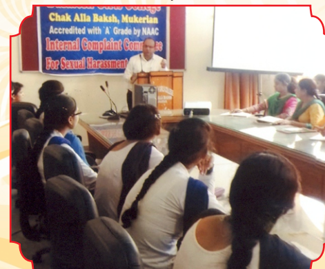
Lecture Delivered on NALSA