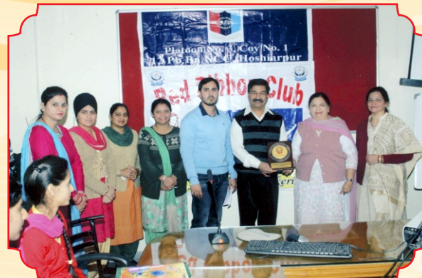
Red Ribbon Club